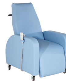
Fixed lounge style armrests

Regency Result3 RR 3245: RR3245S Regency Result3 with Vienna Armrests: RR3245S.3E-V