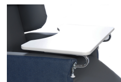
Standard meal/activity tray with PVC edge