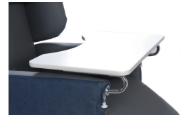
Standard meal/activity tray with PVC edge