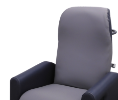
50 Bahama Series