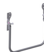
CPR Layflat Bar (only available on Result3 Chairs)