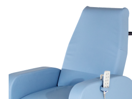
45 Euro Series