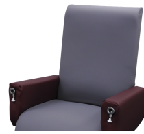
40 Standard Series (without wings)