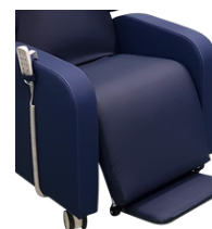
Deluxe Legrest (With Fold-Away Footplate)