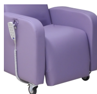
Standard Legrest (No Footplate)