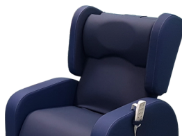
40 Standard Series (with wings)