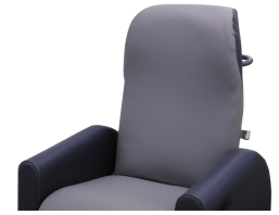
50 Bahama Series