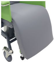
Standard Legrest (No Footplate)