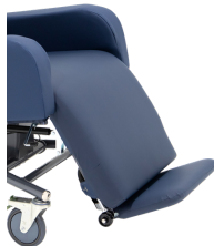
Deluxe Legrest (With Fold-Away Footplate)