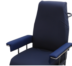
45 Euro Series