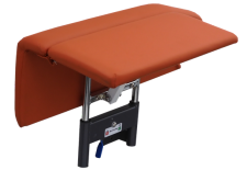
Procedure Tray Arm