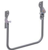
CPR Layflat Bar