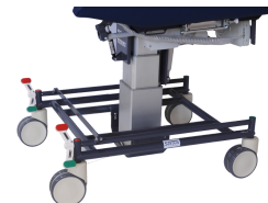
Central Lock Base