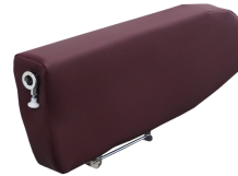
Standard Removable Arm