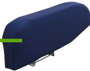
No Meal Tray Arm